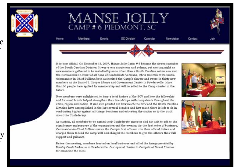
New Manse Jolly Camp 6 Internet site

This is another great example of the Manse Jolly Camp 6 taking the lead in the Development of the SCV in South Carolina and the world.