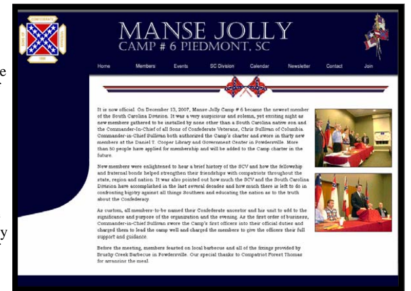
New Manse Jolly Camp 6 Internet site

This is another great example of the Manse Jolly Camp 6 taking the lead in the Development of the SCV in South Carolina and the world.