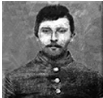
Manse Jolly Camp 6, SCV P.O. 2337 Anderson, SC 29622

Next Meeting April 12th at 9 a.m. at the Powdersville Library and Government Center Meeting scheduled 2nd Saturday of every other month