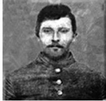
Manse Jolly Camp 6, SCV P.O. 2337 Anderson, SC 29622

Next Meeting April 12th at 9 a.m. at the Powdersville Library and Government Center Meeting scheduled 2nd Saturday of every other month